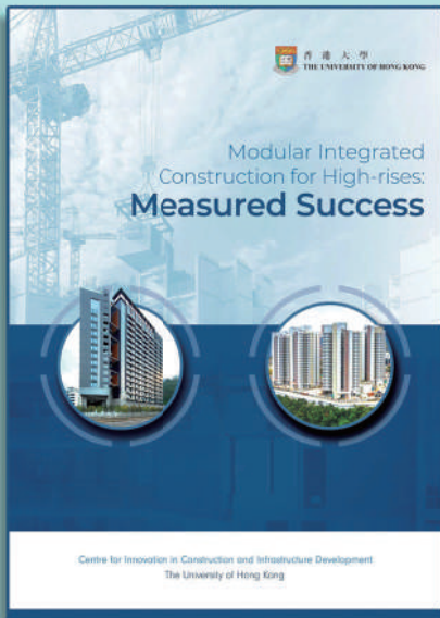
MiC for High-rises: Measured Success