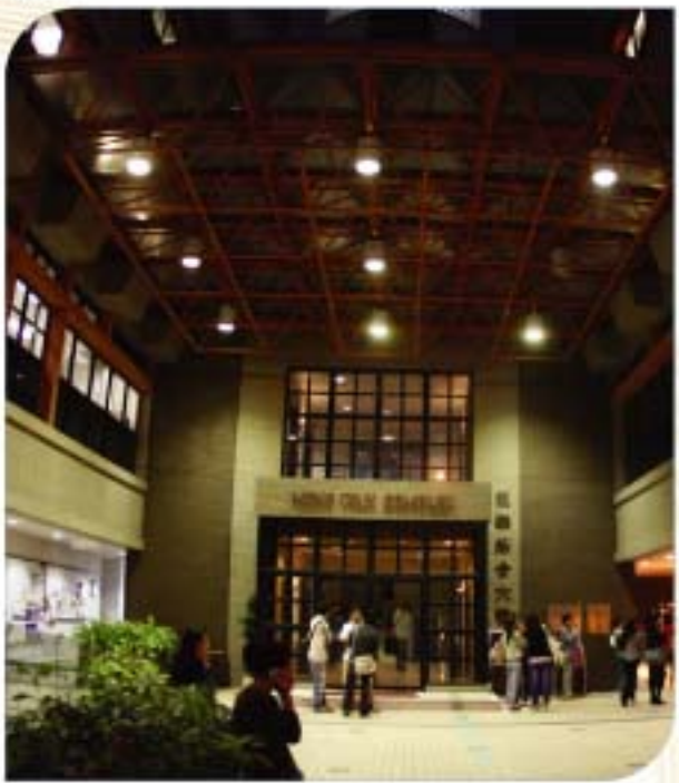
Meng With Complex