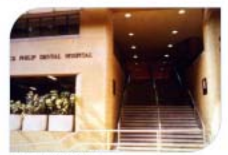
Faculty of Dentistry