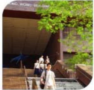
Haking Wong Building