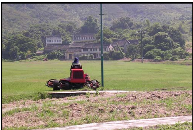
Fig. 4. Will this heavy machine arrive at Luk Keng one day?.

See also Porcupine! 16, 19 and 21 and the update on Sham Chung in this issue.