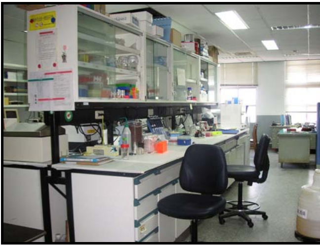
Fig.2. The lab in National Taiwan University I worked in.

Chiu, T.S. (1999). The larvae of fishes in Taiwan . National Museum of Marine Biology and Aquarium. 296pp.