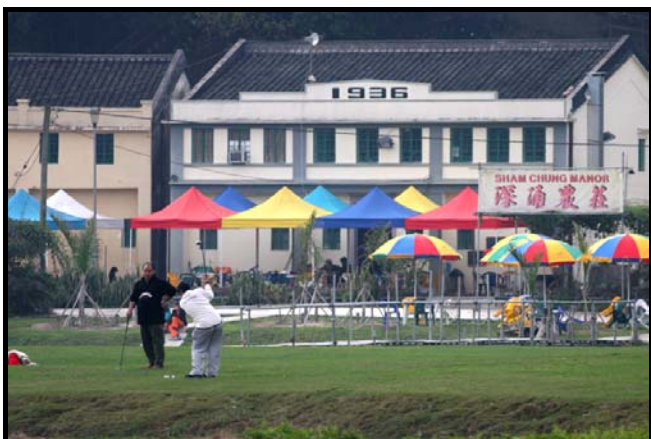
Fig. 5. Nothing is impossible! Building a golf course by filling in an ecologically important freshwater marsh in Hong Kong.