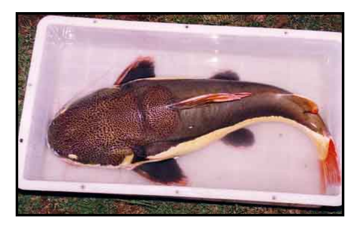
Fig. 8. The redtail catfish ( Phractocephalus hemiolioterus ), a freshwater fish that naturally occurs only in South America. This species was introduced into Mainland China in the late-1990s for public aquarium exhibition. An individual was caught from the Pearl River Estuary in 2001.

fishery management. Its fishery collapsed in the 1980s. Since then its spawning aggregations have never reappeared. Second, captive breeding started, following over-exploitation, by using only small number of broodstock from the wild and then a small number of broodstock was taken from captivebred individuals. This may reduce the genetic diversity of the species after several generations in captivity. Third, largescale and long-term restocking programmes in the last decade in the East China Sea, the major source area for this species, by restocking captive-bred juveniles with low genetic diversity, may further contaminate the gene pools of its wild stocks. The case of the large yellow croaker sends a clear message of the importance of maintaining genetic variation, conserving biodiversity, and of timely, sufficient and effective management.