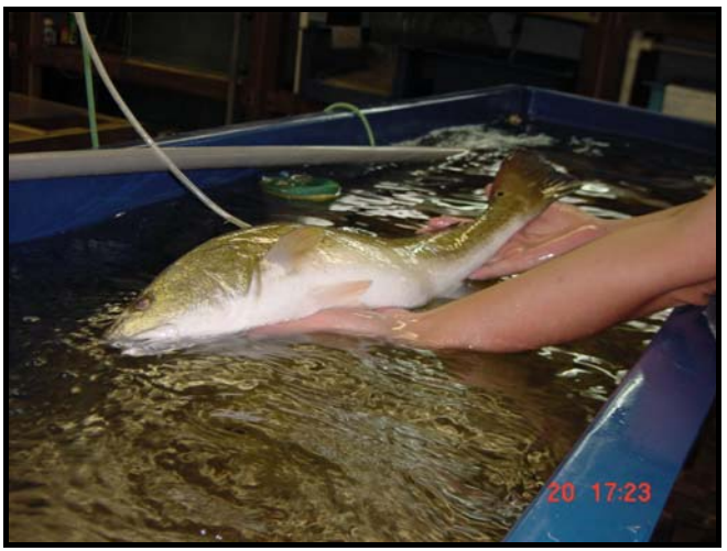
Fig. 7. An individual of the red drum ( Sciaenops ocellatus ) was caught in the bay of the Swire Institute of Marine Science (SWIMS) on 20/06/06. The culture scale of this exotic species in southern Mainland China is large; the individual could have escaped from fishing vessels during transport or from floating cages or even intentional releases.

fishery management. Its fishery collapsed in the 1980s. Since then its spawning aggregations have never reappeared. Second, captive breeding started, following over-exploitation, by using only small number of broodstock from the wild and then a small number of broodstock was taken from captivebred individuals. This may reduce the genetic diversity of the species after several generations in captivity. Third, largescale and long-term restocking programmes in the last decade in the East China Sea, the major source area for this species, by restocking captive-bred juveniles with low genetic diversity, may further contaminate the gene pools of its wild stocks. The case of the large yellow croaker sends a clear message of the importance of maintaining genetic variation, conserving biodiversity, and of timely, sufficient and effective management.