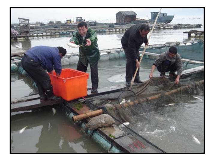
Fig. 10. High fish mortality in inshore floating cages when disease breaks out. (Photo: Prof. Chen Jiaxin).