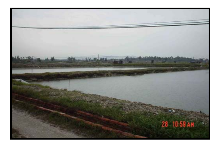
Fig. 2. Earthen ponds for grouper and snapper culture in Lingshui (Hainan Province). The investment is relatively low. Fish culture is divided into certain stages, e.g. juvenile culture (from new-hatched larvae to about 5-10 cm TL), grow-out culture (from about 5-10 to 20 cm TL, <500 g), and market size culture (from <500 g to market size). Farmers only focus on one of these stages.

Here I do not intend to look into this industry in great detail. Instead, I discuss several of the problems that the marine fish culture industry in Mainland China faces. From both