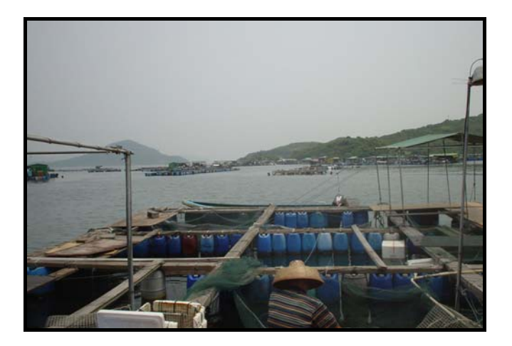
Fig. 4. Inshore floating cages for multiple fish species cultured in a Hong Kong mariculture zone. The marine fish culture industry in Hong Kong faces similar problems to Mainland China and elsewhere, such as water pollution and diseases. Meanwhile, high operation investment in Hong Kong makes cultured fish prices higher than those in Mainland China, and less competitive (Chan 2005).

these species (Sadovy, 2001). For instance, for the Hong Kong grouper (Epinephelus akaara) (Fig. 6), listed as 'endangered' on the IUCN Red List in 2003 and the most expensive grouper in Hong Kong's live food fish market today, captive breeding has never been successful on a large scale since first attempted in the 1960s. The mariculture production of this species is still mainly from 'growing-out' juveniles (Wang Hansheng, wild-caught personal communication). Shortage of governmental financial support for biological and ecological studies, and with lack of management, its fishing condition and biological status have little chance to improve. Information on its spawning behaviour in the wild, spatial and temporal movement patterns and habitat use throughout its life cycle, population size, landing volumes and catch per unit effort are needed for carrying out management initiatives. Such information, in turn, can also provide guidelines to improve captive breeding techniques (Liu & Sadovy, 2006).