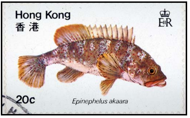
Fig. 6. The Hong Kong grouper (Epinephelus akaara)