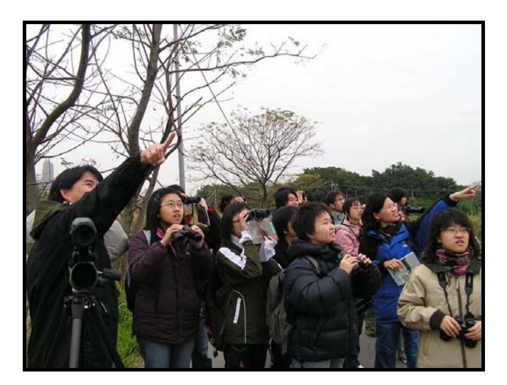
Fig. 2. Bird watching at Mai Po.

Finally, we would like to take this opportunity to express our gratitude to all Departmental staff, graduates, postgraduates and members who have given us so much support and advice over the past six months. Although we did not accomplish all our goals, we will continue to do our best for the interests of our members, and serve as a bridge between the Department and our members.