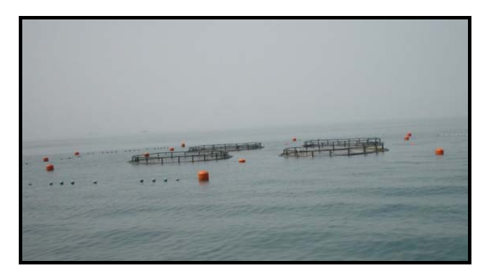
Fig. 5. Offshore submergible cages for cobia ( Rachycentron canadum ) and Greater amberjack ( Seriola dumerili ) culture in Nanao (Guangdong Province). These cages can be submerged when typhoons or red tides come.

these species (Sadovy, 2001). For instance, for the Hong Kong grouper (Epinephelus akaara) (Fig. 6), listed as 'endangered' on the IUCN Red List in 2003 and the most expensive grouper in Hong Kong's live food fish market today, captive breeding has never been successful on a large scale since first attempted in the 1960s. The mariculture production of this species is still mainly from 'growing-out' juveniles (Wang Hansheng, wild-caught personal communication). Shortage of governmental financial support for biological and ecological studies, and with lack of management, its fishing condition and biological status have little chance to improve. Information on its spawning behaviour in the wild, spatial and temporal movement patterns and habitat use throughout its life cycle, population size, landing volumes and catch per unit effort are needed for carrying out management initiatives. Such information, in turn, can also provide guidelines to improve captive breeding techniques (Liu & Sadovy, 2006).