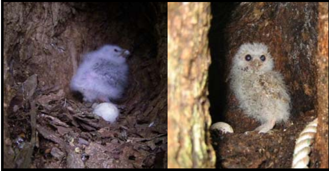
Fig. 11a. Collared Scops Owl chick after being returned to its nest in Sai Kung. Fig. 11b. The same owl chick, two weeks later.

In June 2005, WARC staff were called on a number of occasions to deal with bats that had apparently been washed out of their roof roosts during heavy rain. A bat box was produced and erected near to the roost site to help place bats back in a dry environment. This had limited success, as some bats were young and were not being cared for by adults. It would be interesting to know how widespread this phenomenon is during torrential rain.