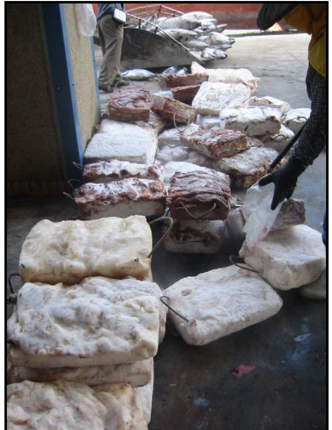
Fig. 9. Many fishes, such as sharks and sunfish, are dissectioned onboard and their muscle and internal organs separately frozen. The same method can be used to process whale sharks to evade the quota monitoring system.