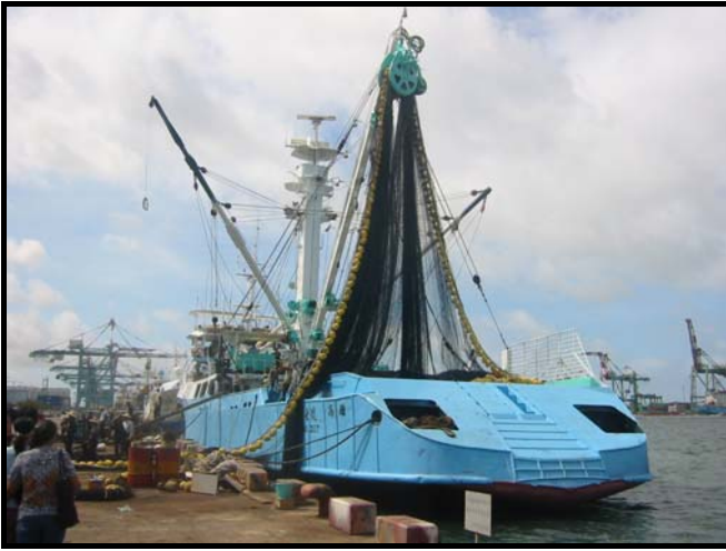
Fig. 2. Example of an advanced fishing vessel used for distant water fisheries with a 1.2 km long purse seine that can cover an area of 400 m 2 . It is equipped with a helicopter that can facilitate searching for tuna, and with a deep freezer to preserve the tuna at < -60°C.

substantially and fishermen have switched to catch more bigeye tuna T. obesus and yellow-fin tuna T. albacares which will be eventually depleted as well. We do need to ask what is the sustainable harvest rate or yield in the ocean?