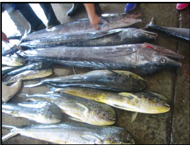
Fig. 8. Dorado fish, Coryphaena hippurus , are commonly caught by vessels using long-lines.