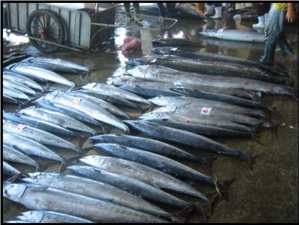
Fig. 7. Hundreds of various sizes of swordfish with their sword removed. Many of them were over two meters in length.