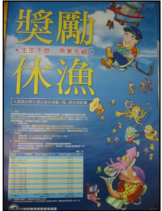
Fig 1. An official poster announcing the fishing moratorium incentive schemes. There are two schemes:

Taiwan has been heavily subsidising the fishery industries. Due to the significant decline in coastal and offshore fisheries, the government has been promoting and helping the development of distant water fishing. So far, there are 30 advanced vessels in Taiwan (like the one shown in Fig. 2) which can be operated in deep-waters for catching high value