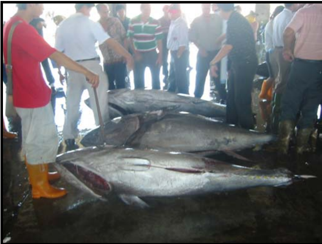
Fig. 3. Price negotiation between fishermen and buyers on the blue-fin tunas Thunnus thynnus . This was an exciting event in the port with many people watching and engaging in the negotiation.

Different sizes of vessels will be awarded with different amounts of money from the Government to compensate their loss during the moratorium. For example, vessels of 60-70 tonnes will be paid NT $30,000 for option (1) or NT $ 133,000 per 60 days for option (2). The schemes are incentive-driven and very flexible when compared with the one in P.R. China.