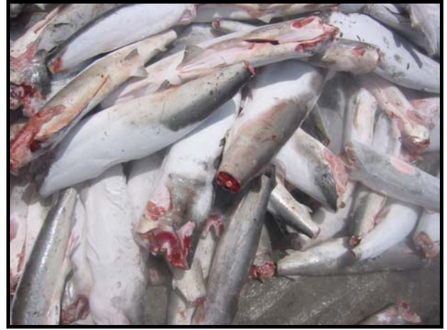
Fig. 10. Taiwanese fishermen argue that they never conduct 'finning practices' on sharks and that Taiwanese use every single part of the shark for consumption. They also believe that many shark stocks are still very healthy and that no quota should be implemented for sharks. But, as you can see this picture, just a tip of an iceberg, thousands of sharks are killed everyday.