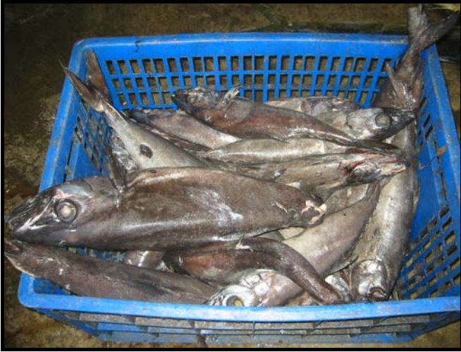
Fig. 6. Toothfish (or oily fish), Dissostichus species are also common in the offshore and distant water catches of Taiwanese fishermen.

sounds optimistic and environmentally friendly. I hope they will achieve 'sustainable fisheries' through practice.