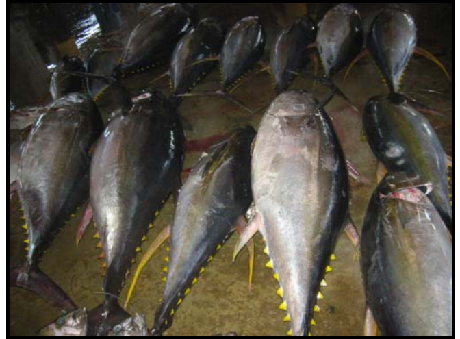
Fig. 4. Tens of yellow-fin tunas Thunnus albacares were displayed awaiting deals between the seller and buyer.