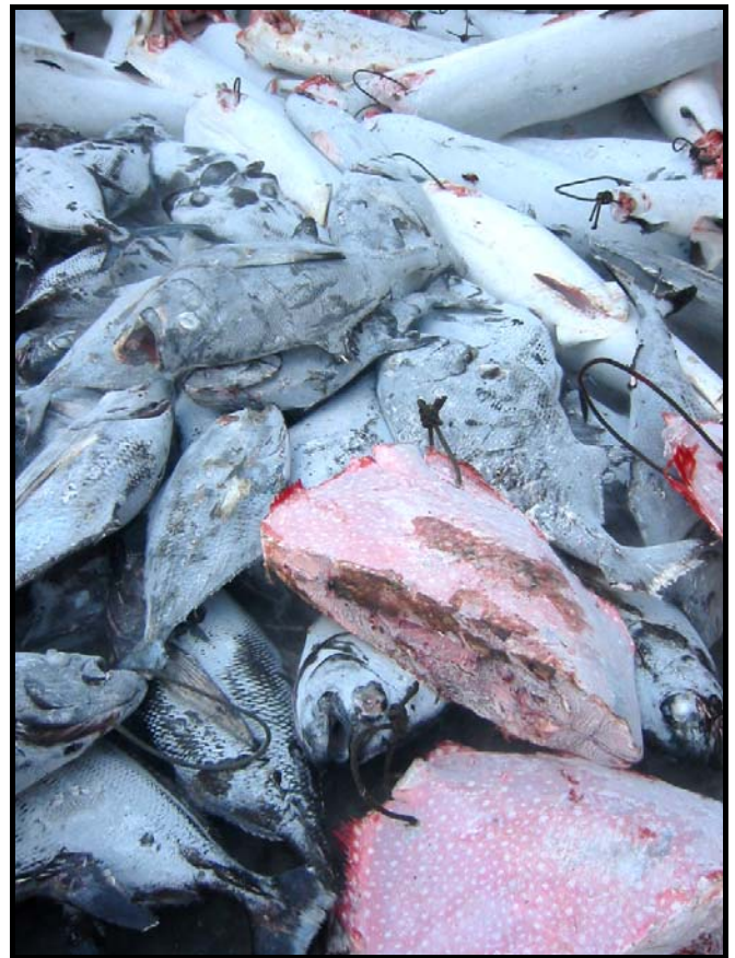
Fig. 5. Vessels using long-lines or long purse seines often catch many different fish species including sunfish, moonfish and many different shark species.

Let's talk about the bright side. I was delighted to see that some fisheries organisations have incorporated 'green education' in their eco-tours. During our visit, the word 'sustainability' has been mentioned many times by the presidents, directors, managers and fishermen in various fishery organisations, indicating that they do understand that marine resources are limited, and will be seriously depleted without proper management and enforcement. At least, it