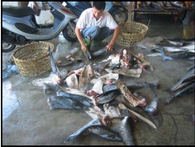
Fig. 11. Every single bit of the shark fin is removed and processed immediately after landing. There is a huge demand for shark fins regardless of the shark species, or their size, throughout SE Asia.