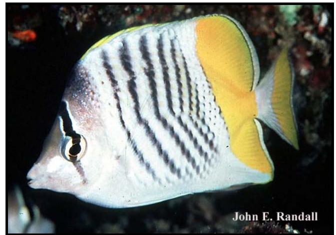
Fig. 2. The atoll butterflyfish ( Chaetodon mertensii ) (Photo: John E. Randall).

the atoll butterflyfish ( C. mertensii ) (Fig. 2) from the Indo-west Pacific, and the Eritrean butterflyfish ( C. paucifasciatus ) (Fig. 3) from the Red Sea and neighbouring Gulf of Aden. However, neither has the strong crosshatched pattern seen in the pearlscale butterflyfish.