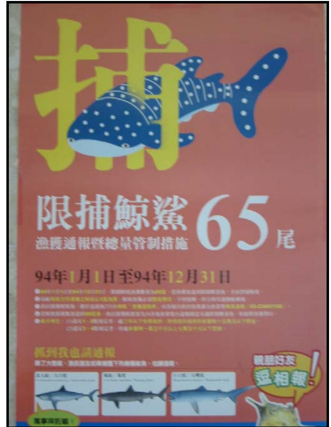
Fig. 3. Information on protective legislation

What can we do to protect the vulnerable whale shark? First, we should not eat them. If everyone resists consuming them, there will be no demand for them. But it is extremely difficult to educate and change peoples' minds especially in SE Asia. Secondly, we can help fishermen to establish an eco-tourism business for watching whale sharks, or diving with them instead of killing them. Such eco-tourism has been proved to be sustainable and profitable in many places [1]. Something that you may not know, we can in fact also dive with whale sharks in waters nearby Hong Kong. Last Sunday, I watched a TV documentary made by TVB; it featured the underwater treasures in Hong Kong. In eastern waters, two professional divers found and filmed a young whale shark (5-6 m long) near a place called "Tai Ching Jum" and they certainly enjoyed swimming with this lovely creature. I would like to propose that SWIMS organize a trip for us to dive with our 'local' whale shark. Perhaps, we should also carry out some insightful scientific studies with a view to learning more about this magnificent fish.