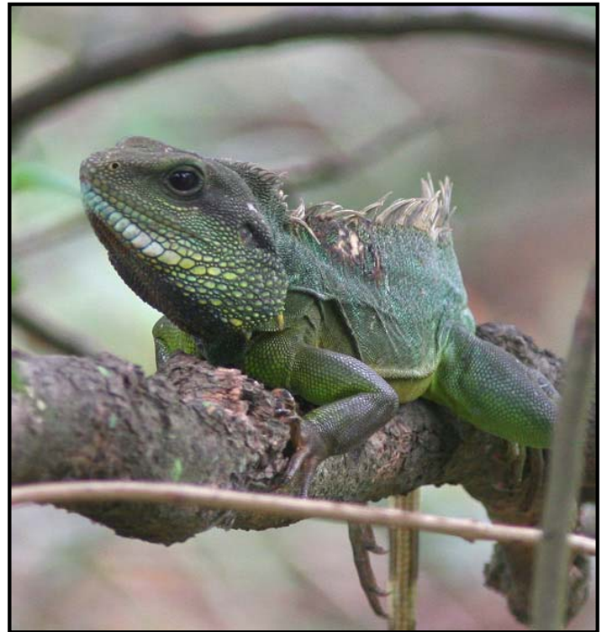
Fig.2. An adult male (> 60 cm from head to tail) resting on a branch.