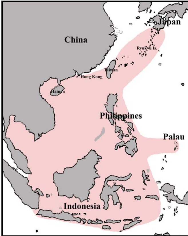
Map 1. Global distribution of the pearlscale butterflyfish ( Chaetodon xanthurus ).

The pearlscale butterflyfish can be readily distinguished from other members of the genus Chaetodon by the cross-hatched pattern on body sides due to black scale margins (Fig. 1). The recorded maximum size of the species is approximately 14 cm standard length. Juveniles are particularly restricted to live coral areas and remain close to shelter; adults can be found in outer reef slopes and drop-offs to a depth of 50 m (Allen et al 1998). Fish usually occur singly or in pairs and are active during daylight hours feeding on small benthic invertebrates and algae. Little is known about the biology of this species.