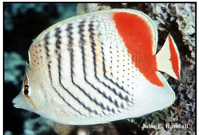
Fig. 3. The Eritrean butterflyfish ( Chaetodon paucifasciatus ).

Temperature and salinity of nearshore waters of Hong Kong, especially in the east, are determined by three major water currents; the Kuroshio Current from the Pacific and the Taiwan Current from the East China Sea in the winter, and the Hainan Current from the South China Sea in the summer, which support subtropical and tropical marine fish species in the area. It is likely that these currents bring some unusual marine fish larvae or juveniles to settle in Hong Kong waters; however, it is not clear whether these species are able to maintain a population locally (Sadovy & Cornish 2000).