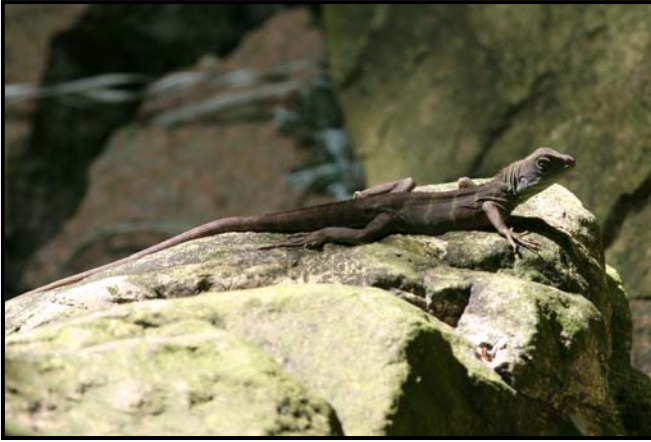
Fig. 3. Medium sized female (~ 45 cm long) (Photo: Allen To).

Zhao, E.M. & Adler, K. (1993). Herpetology of China . Society for the Study of Amphibians and Reptiles in cooperation with Chinese Society for the Study of Amphibians and Reptiles. Oxford, Ohio, USA. 522pp.