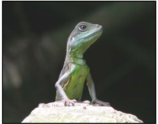
Fig. 1. The smallest juvenile (~ 30 cm long).

The water dragon, is semi-aquatic and is distributed in China, Thailand and Vietnam (Lau, 1995; Zhao & Adler, 1993). There is no known previous record of this lizard in the wild in Hong Kong (Bogadek & Lau, 1997; Karsen et al. , 1998). However, it is commonly available in local reptile pet shops for sale (Lau et al. , 1997). Thus, it is very likely that these water dragons were released by people who used to keep them at home as pets. If this population in Tsing Yi is breeding successfully and expanding, it becomes an additional naturalized exotic species in Hong Kong. However, it does not appear on the IUCN Global Invasive Species Database and is therefore not considered invasive anywhere in the world. [1]