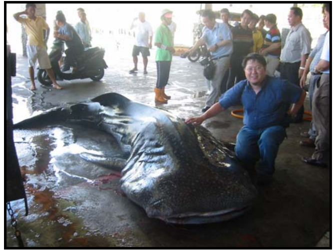
Fig. 1. A young male whale shark Rhincodon typus .

Unfortunately, the flesh of R. typus is considered a delicacy by many people in China, Taiwan, Singapore, Korea and Japan, leading to overexploitation in SE Asia. The whale shark is also known as the 'tofu' shark in Taiwan (or the white meat whale in Hong Kong), because of its soft white flesh, and it is now the most expensive of the shark meats available on the market. A set of four dried fins runs US $400-500 in Taiwanese markets while the resale value of frozen whale shark flesh for export to Asian markets has reached over US $1/kg [2]. It is therefore not surprising that significant fisheries for whale sharks have been developed in Taiwan and southern China.