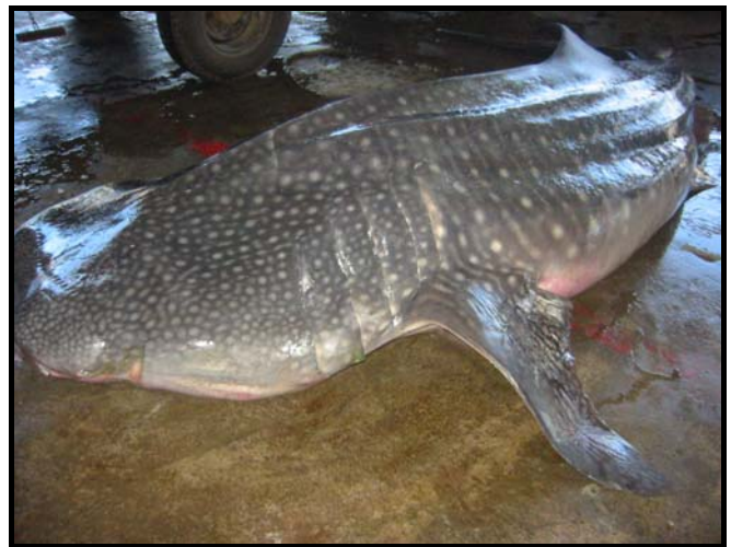
Fig. 2. Young male whale shark.

In early July 2005, I attended a training workshop on modern fisheries, aquaculture and seafood processing in Taiwan which was organised by the Joint Committee of Hong Kong Fisher's Association and the Agriculture, Fisheries and Conservation Department of Hong Kong SAR. During the workshop, we visited several major fishing ports in Taiwan and, sadly, encountered two young males of R. typus (3-4 m in length) (Figs. 1 & 2). Lengths of newborn whale sharks range from 0.55 to 0.65 m while the adult can reach as long as 18 m [1]. Through interviews with fishermen, it was estimated that each shark was worth over HK$ 150,000 (or US $19,230).