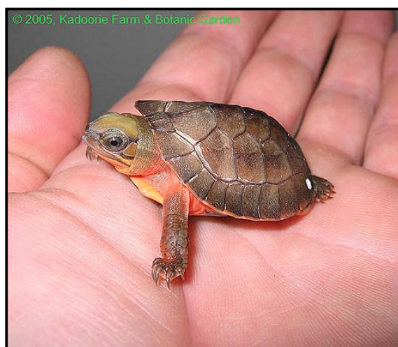
Fig. 2. The first ever Cuora trifasciata of wild HK parentage successfully hatched in captivity.

Captive breeding of the Three Banded Box Terrapin ( Cuora trifasciata ) & Vietnamese Leaf Turtle ( Mauremys annamensis ) continues. The chelonian conservation project achieved a major landmark on the 27 October, when the first ever Cuora trifasciata of wild HK parentage hatched.