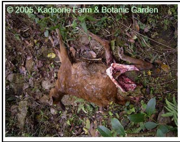
Fig. 3. Barking deer carcass from feral dog kill at KFBG's Apiary, 3 Feb. 2005.