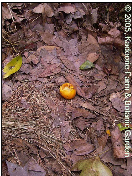
Fig. 4. Deer's resting site, with food item,