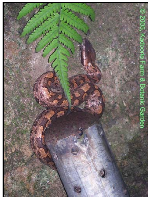
Fig. 1. Mountain Pit Viper at KFBG's Fern Walk, 15 Feb. 2005.

26 February, three Malayan Porcupine between Upper Canteen and Post Office Pillars, and one more by the Raptor Sanctuary.