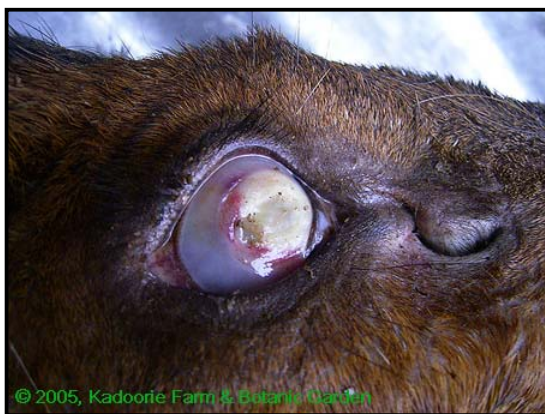
Fig. 5. Severe ulcer in eye – a possible reason why this animal was predated.