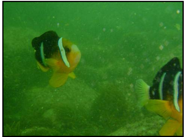
Fig. 2. The anemonefish, Amphiprion clarkii.

Although the Hong Kong government has made an effort to promote marine conservation and protection, for instance through the Big Fish Count and Reef Check, it is not uncommon to hear news about people stepping on corals, stealing corals and catching fish for aquaria. We saw signs of coral bleaching and damage during the Reef Check survey. The increasing frequency of red tides also deserves more attention. It is obvious that marine conservation entails long-term work, much more has to be done and learnt not only by the government, but also by the general public.