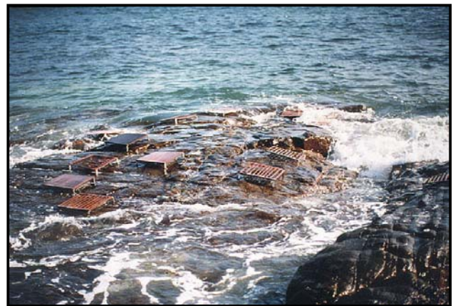
Fig. 2. Experimental units on intertidal area.

The answer is not to abandon observational studies but to lower our expectations of statistics. We cannot avoid using (un)natural (non)experiments when looking at large spatial and time scales - the scales that are often most relevant to conservation problems - but we have to realize their limitations. With a fully replicated and randomized manipulative experiment, confidence in the conclusions is based largely on the results of the statistical analysis – the effect size and p-value. This can never be true for observational studies, including natural and unplanned experiments. In these cases, confidence in the conclusions depends at least as much on the additional information (usually from additional studies or the literature) that allows us to separate the effects of interest from the influence of possible confounding variables. The results will never look as neat as they would be if we simply pretended that we had done an experiment, but they will be nearer the truth. It should also be noted that, while ecologists are typically most interested in the causes of differences, in many practical applications of ecological research (e.g. conservation, forestry and fisheries) the magnitude of the difference is more important than its precise cause. Foresters, for instance, want to know where their trees will grow best, while teasing apart the various factors responsible for differences in growth has a lower priority.