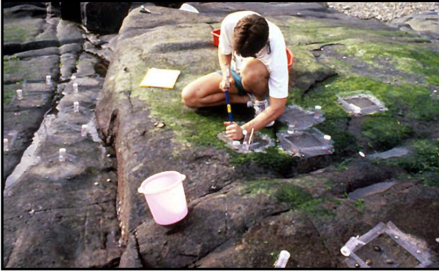
Fig. 1. Setting up controlled study on a rocky shore.

natural experiments - the units are already in treatment groups and the investigator has no control over this. An example would be comparing plant growth on naturally nutrient-rich and nutrient-poor sites.