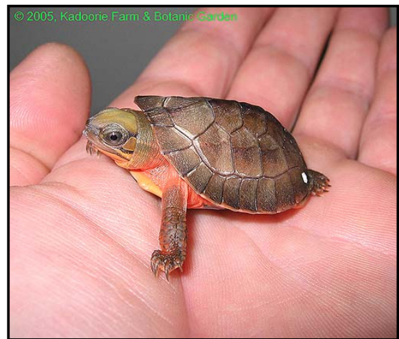
Fig. 2. The first ever Cuora trifasciata of wild HK parentage successfully hatched in captivity.

Captive breeding of the Three Banded Box Terrapin ( Cuora trifasciata ) & Vietnamese Leaf Turtle ( Mauremys annamensis ) continues. The chelonian conservation project achieved a major landmark on the 27 October, when the first ever Cuora trifasciata of wild HK parentage hatched.