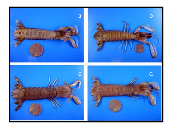
Fig. 2. Four most abundant stomatopod species found in this study (a) Oratosquillina interrupta , (b) Harpiosquilla harpax , (c) Oratosquilla oratoria and (d) Miyakea nepa .