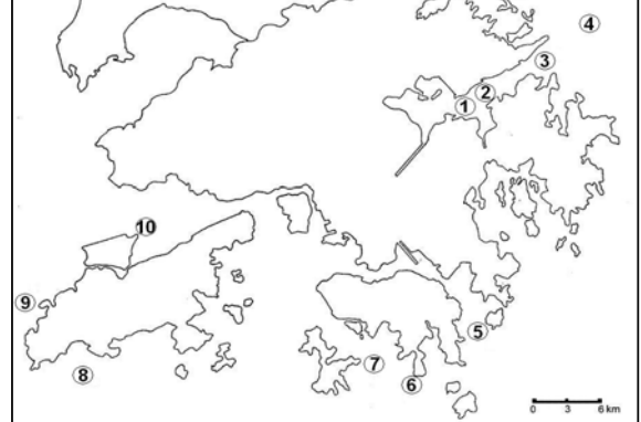
Fig 1. Map showing the trawling stations surveyed