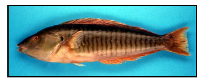
Fig.1. Hologymnosus doliatus Pastel ringwrasse (initial phase) a new record for Cape d'Aguilar.