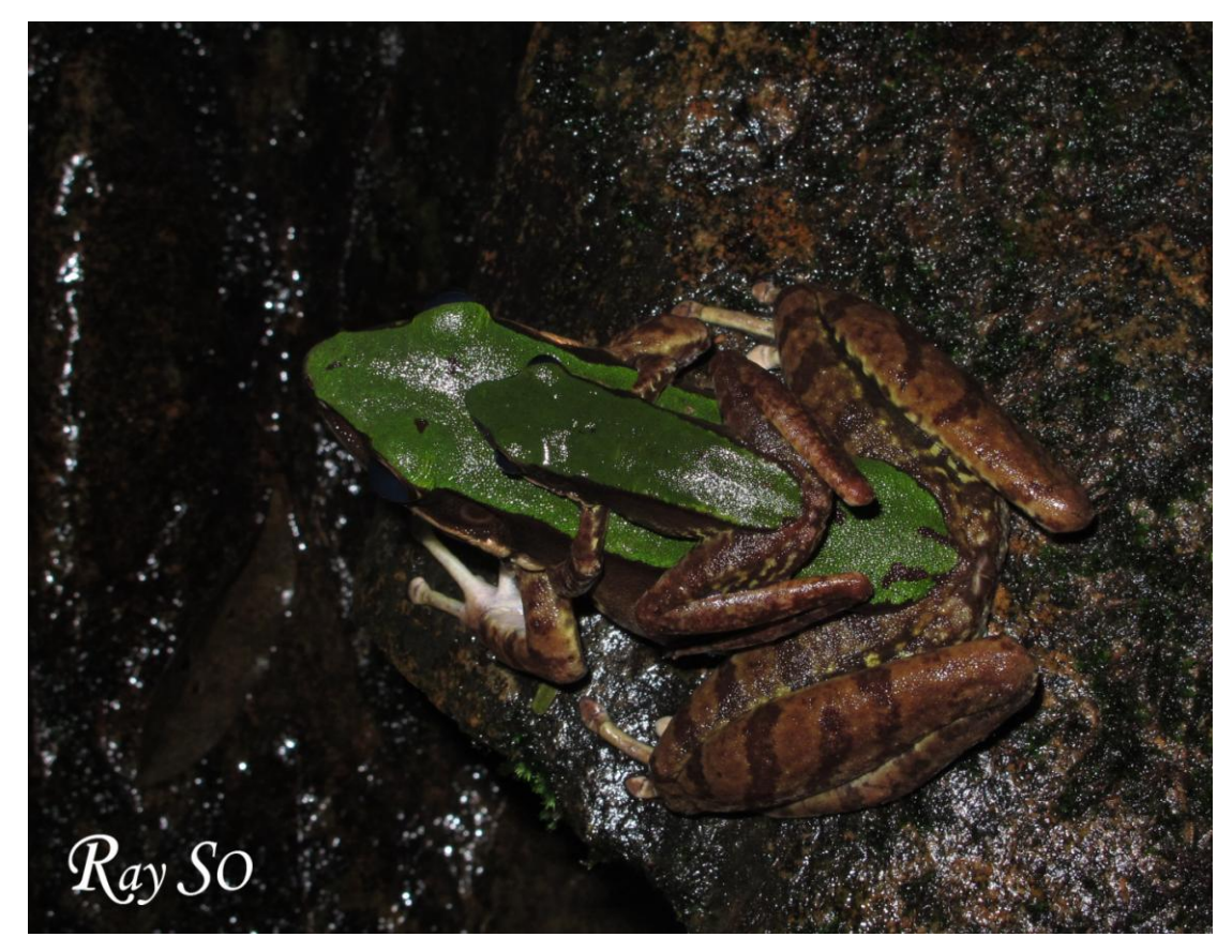
Green Cascade Frog ( Odorrana chloronota ) couple! A locally common stream specialist.