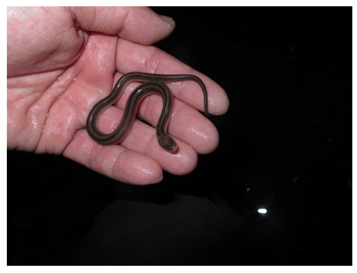
Juvenile Striped Stream Snake ( Opisthotropis kuatunensis ) we found in Tai Po Kau. Locally restricted stream species.