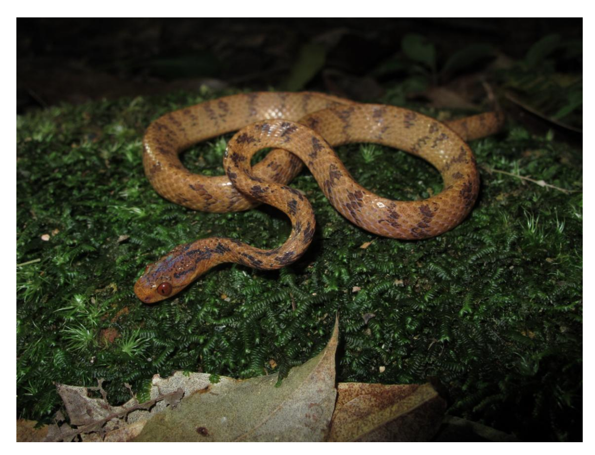
A very good find by Bond Shum- Chinese Slug Snake ( Pareas chinensis ). A locally rare snake of the forest.