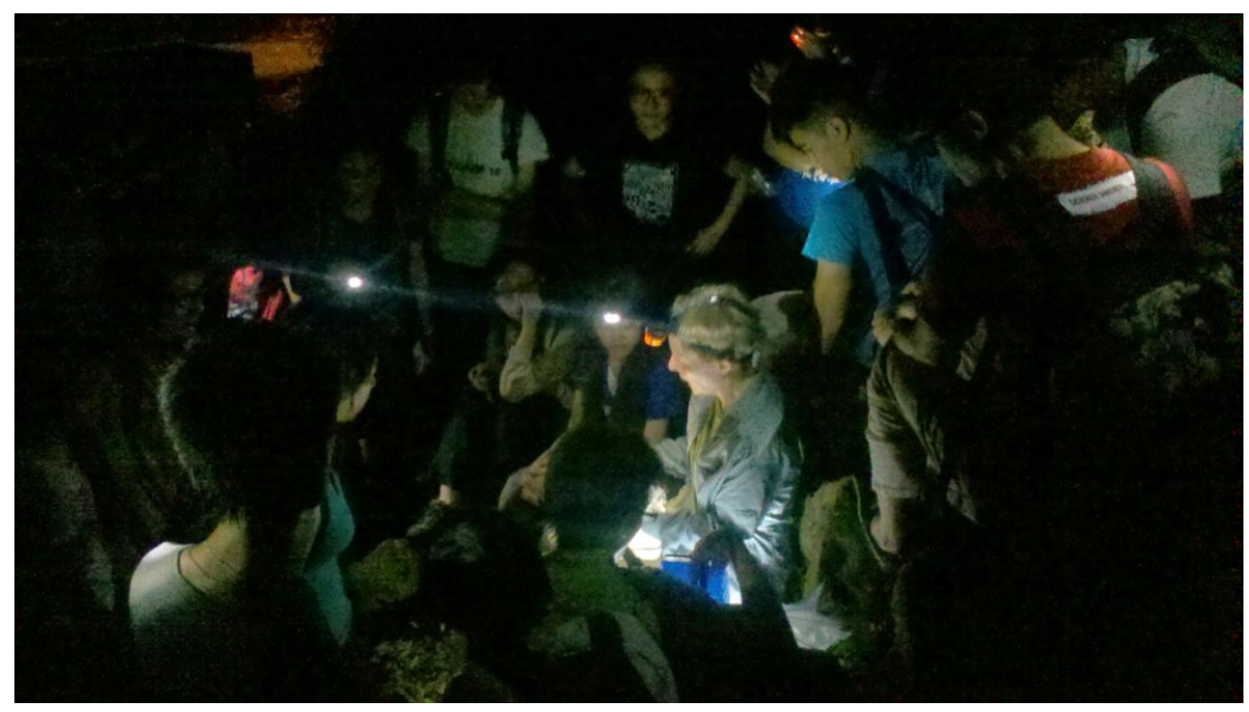
Participants learning amphibian sampling in a forest stream in Lung Fu Shan.