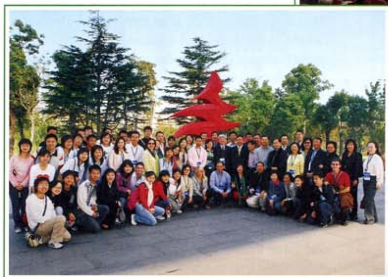
Visit to China Executive Leadership Academy, a government-funded national training institution for high-level officials and business executives.