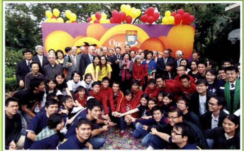
The first year's $100 million target has been met! The second year's matching now begins, we need your continuous support!

In the 3rd Government Matching Grant Scheme launched by the Government on June 1, 2006 on a first-come, first-served basis, HKU has again reached the ceiling granted by the Government. The Matching provides the financial resources needed to implement the University's education and research programs.