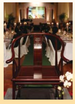
The Endowed Professorships Commemorative Chair is personalized with a customized plaque engraved with the name of the Endowed Professorship