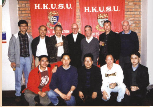
The Organising Committee of the Millennium Barbeque, which was held on January 6 with more than 150 current and past Riccians participated.