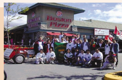
Getting ready to ride the BIG BIKE to raise funds for the Heart and Stroke Foundation.

Our next summer function will be held in August. For more information, please visit our website.