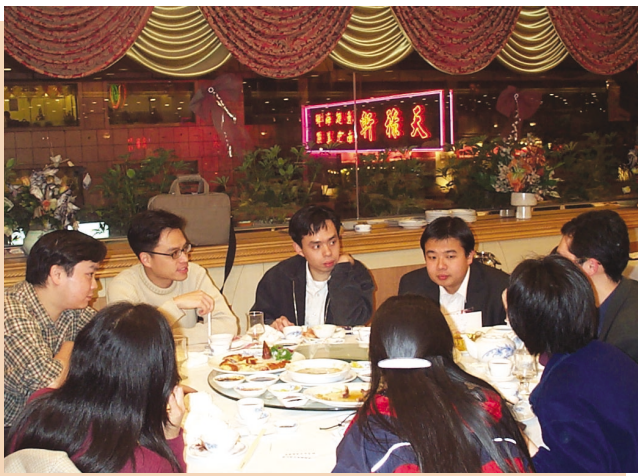
Dinner with our members graduated in the early 90s