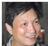
錢鋼，《唐山大地震》作者 香港大學新聞及傳媒研究中心 中國傳媒研究計劃主任